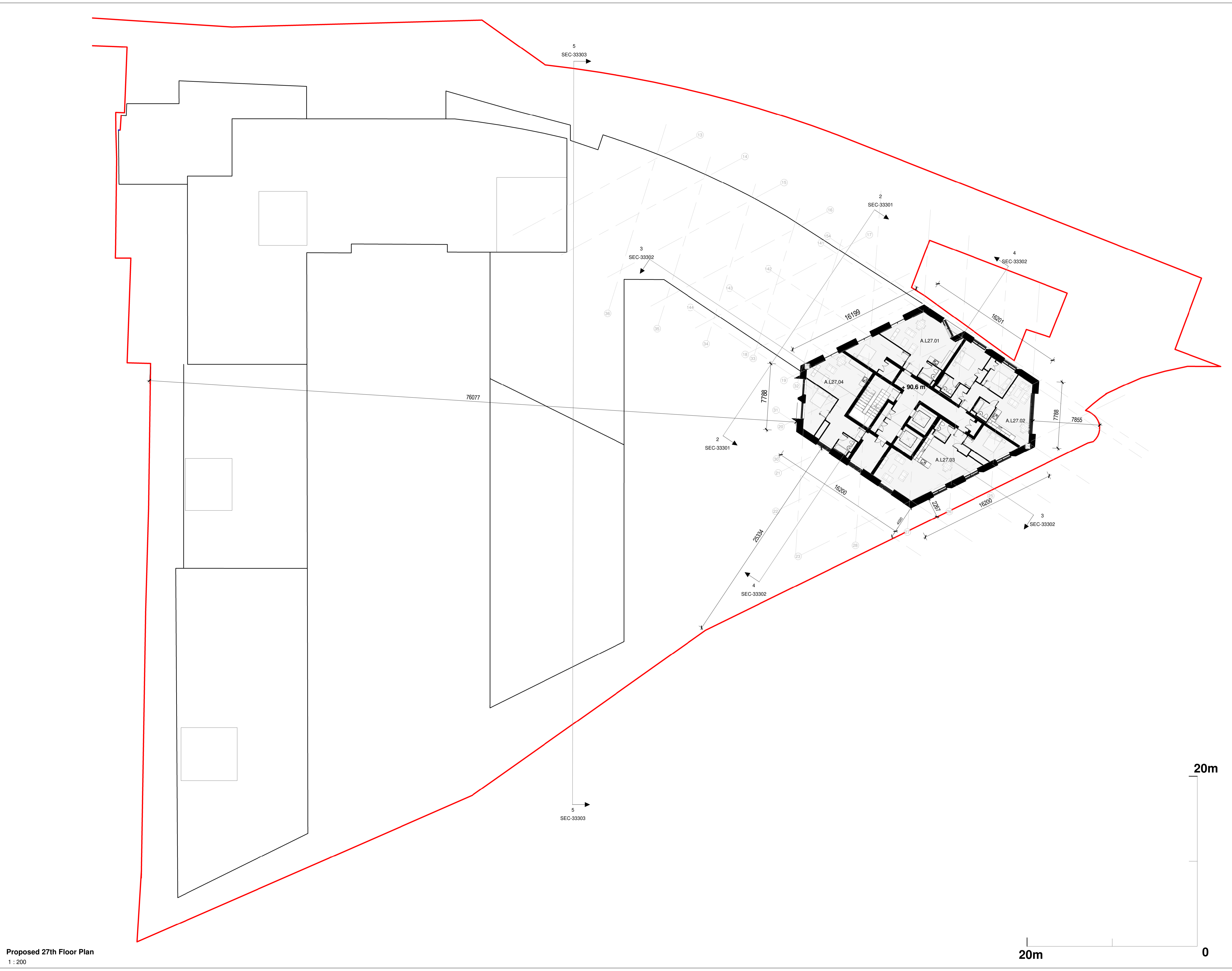
Proposed 27th Floor Plan 1 : 200